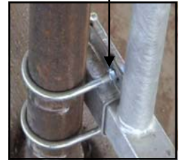
Nuts in the back.