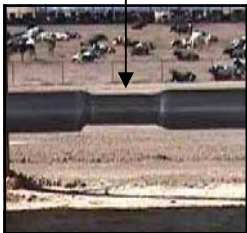
Lock Rail Inserted