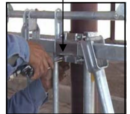
Tightening the U-Bolts