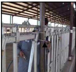
Leveling the U-Bolts